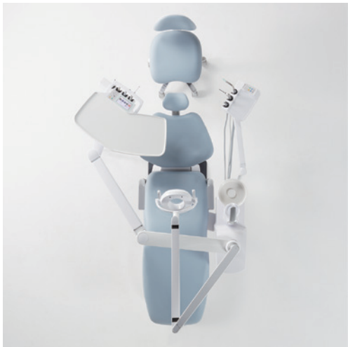
Two-hand The long reach and light movement of the arm facilitate two-hand treatment to be administered without stress.

The compactly designed chair unit can be installed in a space as narrow as 1,8m across for full use of its capabilities, allowing enough workspace for both two-hand and four-hand treatment. The over-arm is fitted for treatment in both standing and sitting positions. The dentist/dental assistant can efficiently administer treatment from various orientations from the 8 o'clock to 2 o'clock directions.