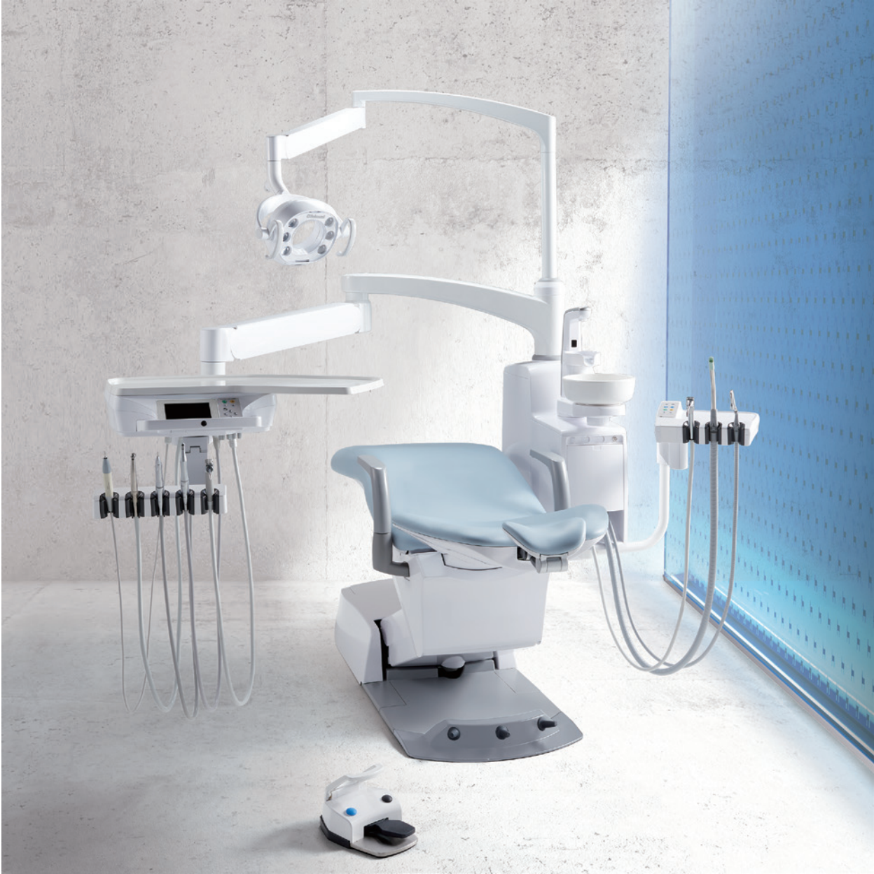
*The installation image for left-handed specification.

Holder's position The holder, designed to be independent from the table, can be freely adjusted with a three-axis adjustment mechanism for the position best suited for each dentist.