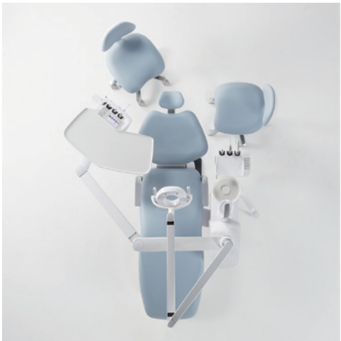
Four-hand In four-hand position, the large tabletop provides a common space for the dentist and the assistant, facilitating smooth treatment.